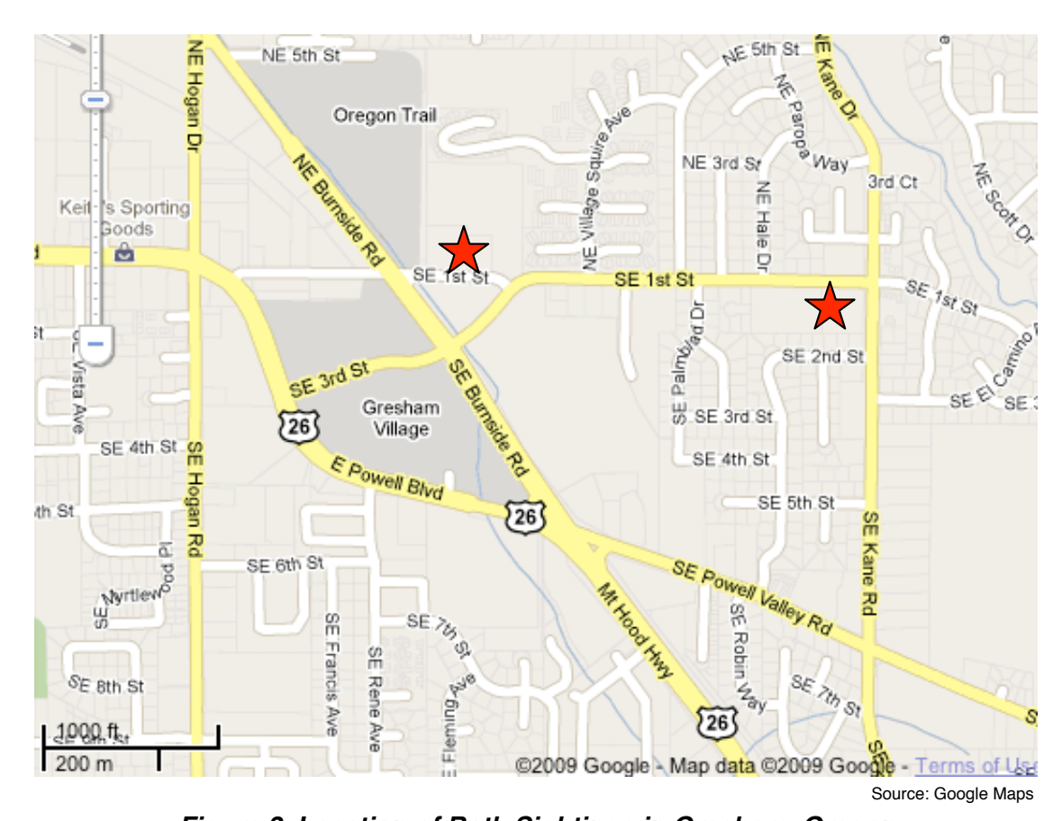
Figure 2. Location of Both Sightings in Gresham, Oregon

This area is a densely populated area of mixed residential and commercial use. There are many stores including automobile dealerships within a mile or so of the witnesses' locations. See Figure 2, Location of Both Sightings in Gresham, Oregon .